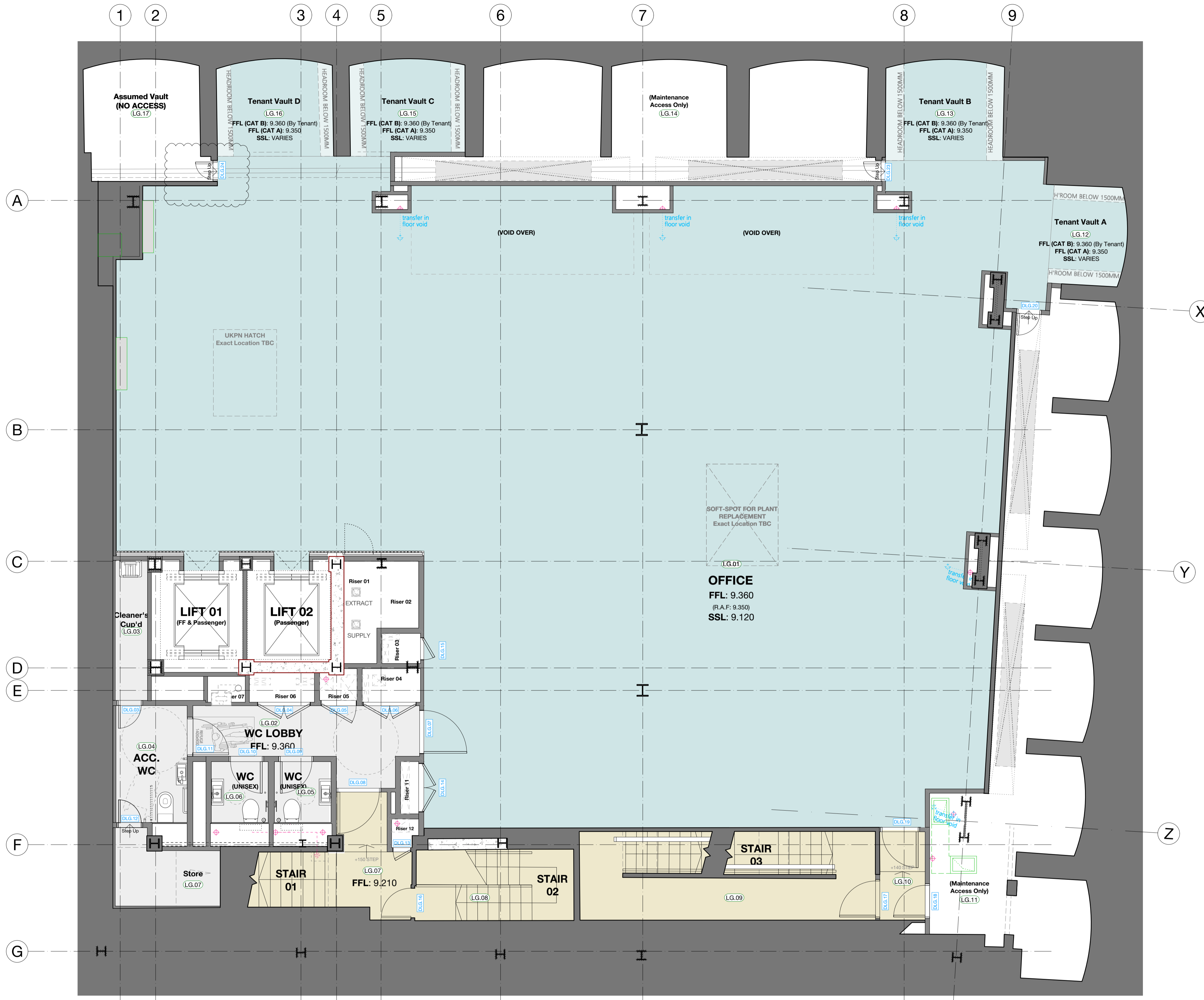
1 Proposed Lower Ground Plan Scale: 1:50